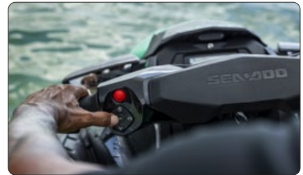
iDF - Intelligent Debris Free System An innovative, industry-first system that allows you to free your pump of weeds and debris with intuitive handlebar-activated controls.