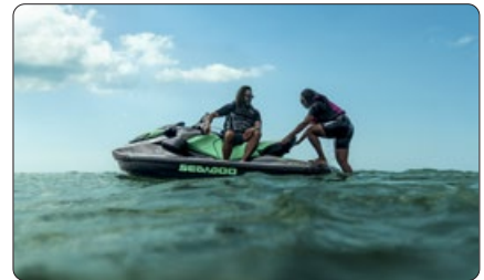
Boarding Ladder Makes boarding from the water easier and quicker.