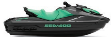
NEW Eclipse Black and Laguna Green