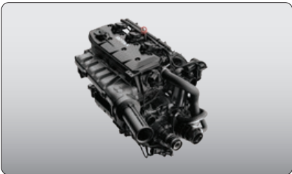
Rotax 1630 ACE - 130 / 170 Enjoy plenty of pep and great fuel economy with the 1630 ACE - 130 or opt for the 170 hp version, the most powerful naturally aspirated engine in the Sea-Doo® lineup.