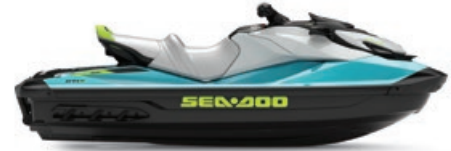
Teal Blue and Manta Green