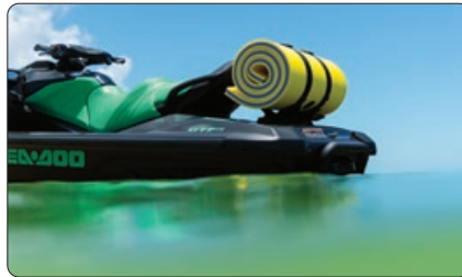
Swim Platform with Integrated LinQ System Exclusive quick-attach system on the largest swim platform in its category that allows for easy installation of accessories! 1