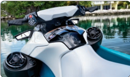
BRP Audio - Premium System (optional) A factory-installed, truly waterproof Bluetooth* audio system for an extra dose of fun and entertainment on the water.